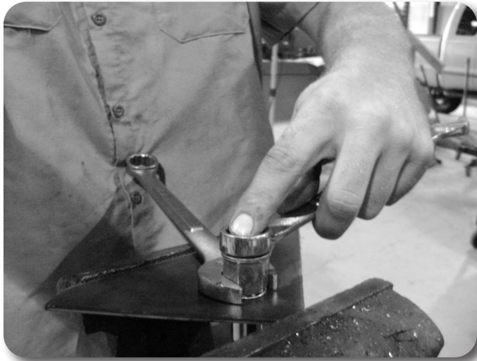
Figure 4 - 1/2" Rivet Nut shown